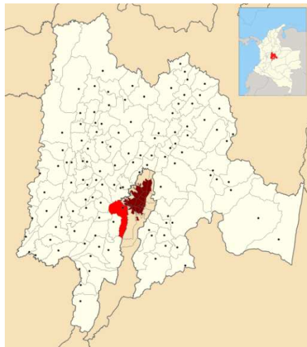
Soacha (bright red) and Bogotá (brown) in the department of Cundimarca and its location in Colombia

Like previously mentioned the focus of this study is on the displaced persons living in a city called Soacha neighboring Bogotá in the department of Cundimarca. According to the latest census in 2005 Soacha has about 400.000 inhabitants (National Census:2005) but other sources believe these numbers to be erroneous and claim numbers of 700.000 or higher to be more likely (SJR:2012).